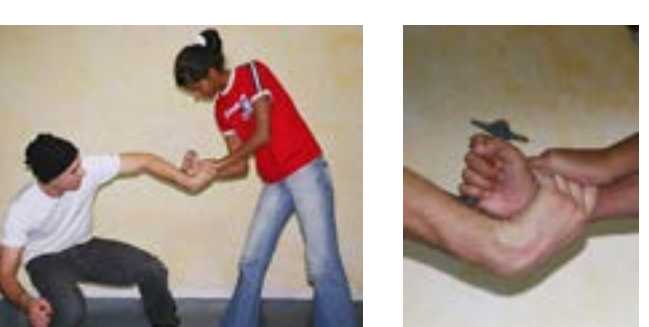
Here demonstrated is a different direction of pressing – from the side. There is no need for precise location or direction because Spikey is doing all the work.