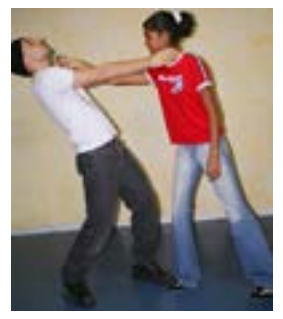
Our head is an important gravity point for our body, so by pushing the attacker's head back we cause his whole body to follow suit